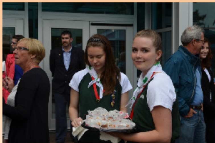
Memories of The Diamond Jubilee Garden Parties held in St. John's and Corner Brook 2012